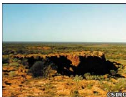
See the Australian site